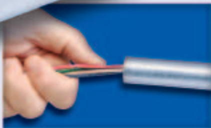
E-Z Wire Pulling

Allied EMT combines strength with ductility, resulting in faster and easier installations. EMT provides easy bending, cutting and joining while resisting flattening, kinking and splitting, creating smooth, continuous raceways for fast wire pulling.